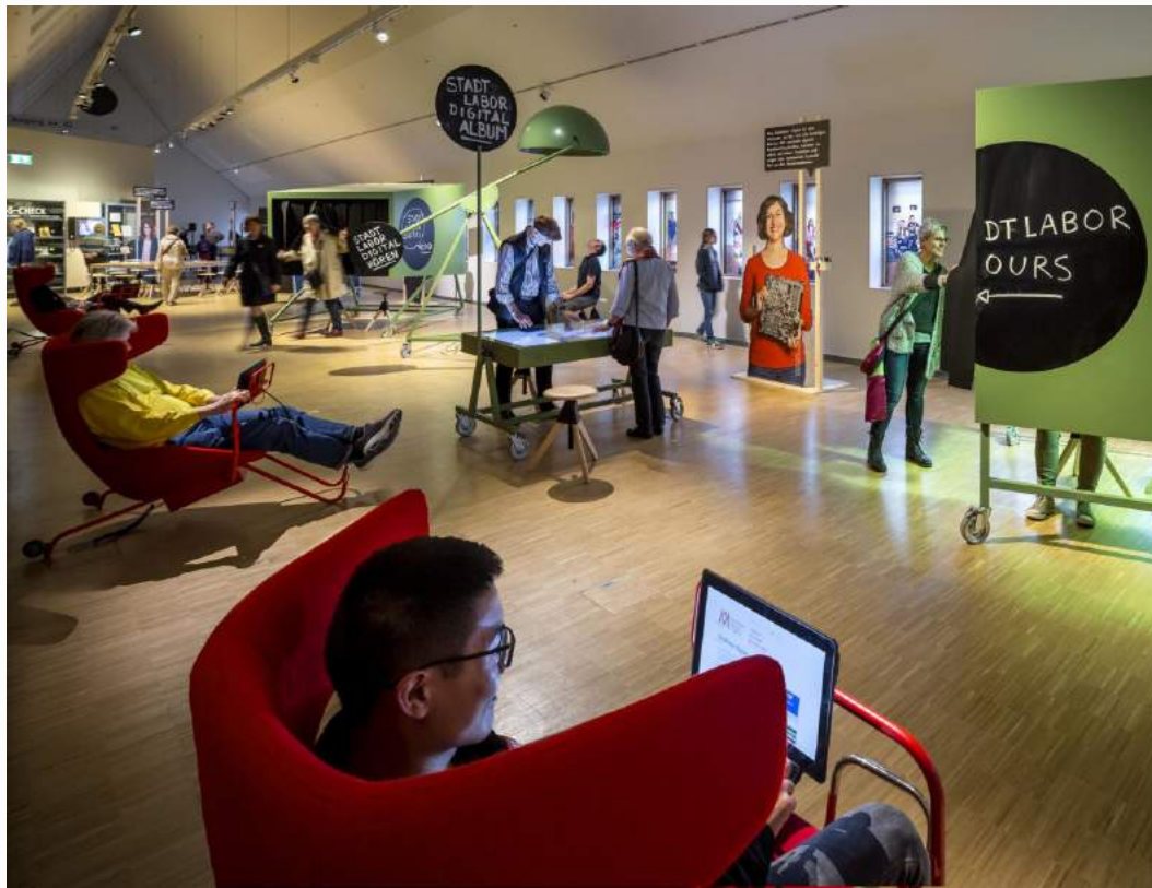
Historisches Museum Frankfurt.

Frankfurt Now!', Kossmann.dejong explains how the lab works. Residents and visitors are actively challenged to participate in the debate, and themselves become part of the Historical Museum Frankfurt, a museum about and engaged with the city.