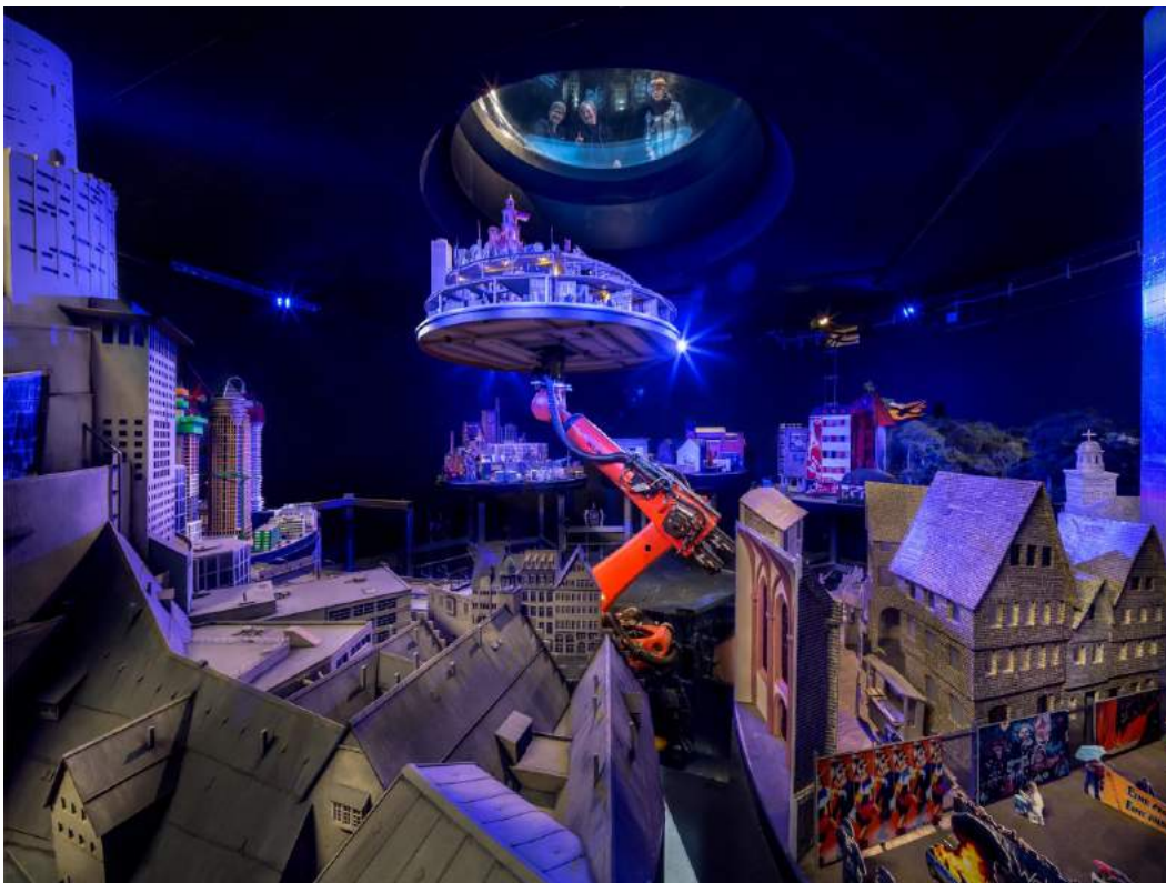
Historisches Museum Frankfurt, Schneekugel.